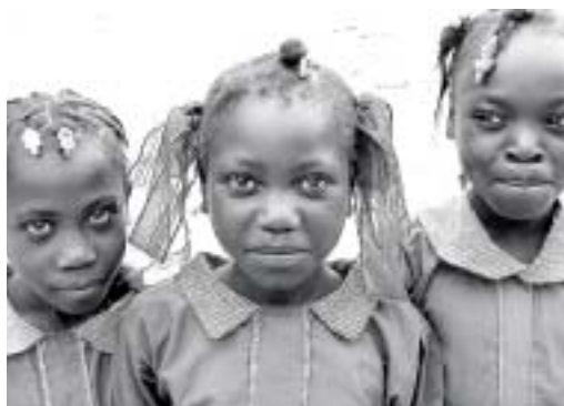
Three girls in school uniforms.

Most families make tremendous sacrifices to send their children to school. They go without meals, work dusk to dawn in the marketplaces, and live in cramped, unsanitary quarters so they can save money. Even with those sacrifices, they often do not have enough to pay for the 14 years of schooling necessary for a student