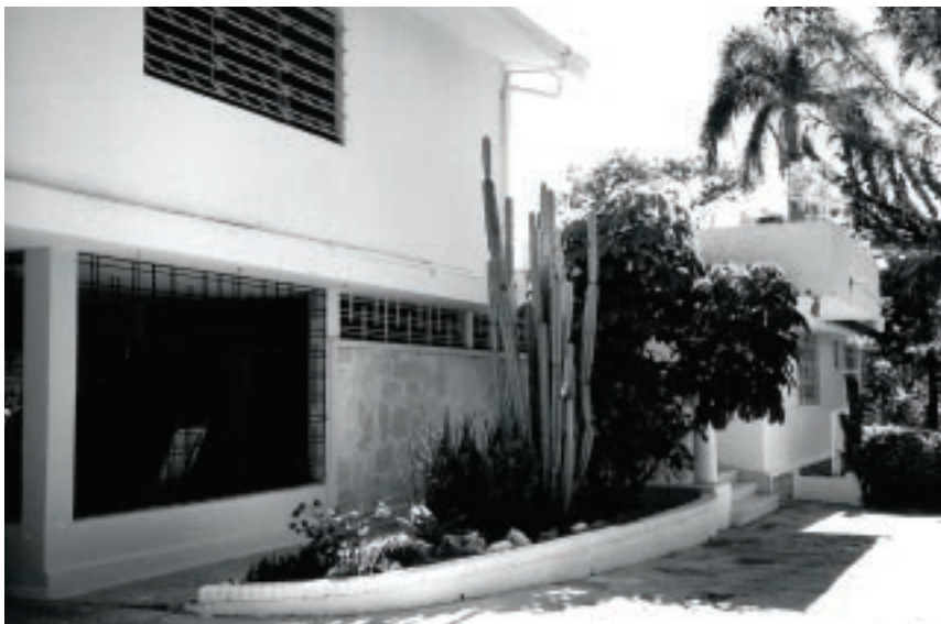
Entrance at the new NMH