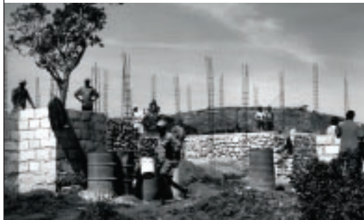
Clinic under construction at Gran Bwa.